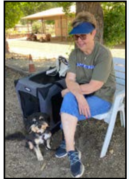
Hanging out, waiting for our turn.