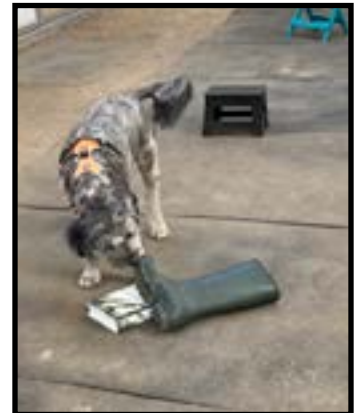
Finding the PRIZE !!