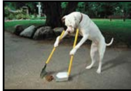
The Perfect Dog - Who's dog is it?

I am wise enough to know that all dogs come with their own personalities and behavioral tendencies, for better or worse, and her two particular