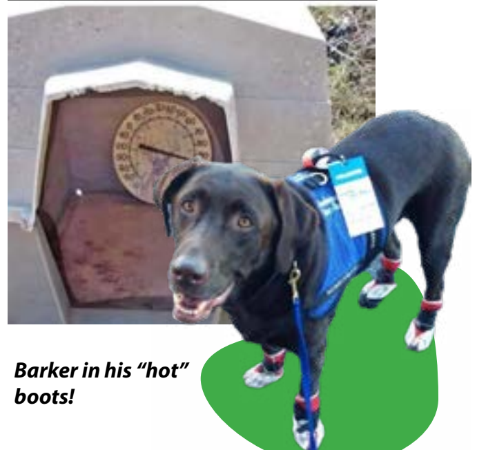
Barker in his "hot" boots!