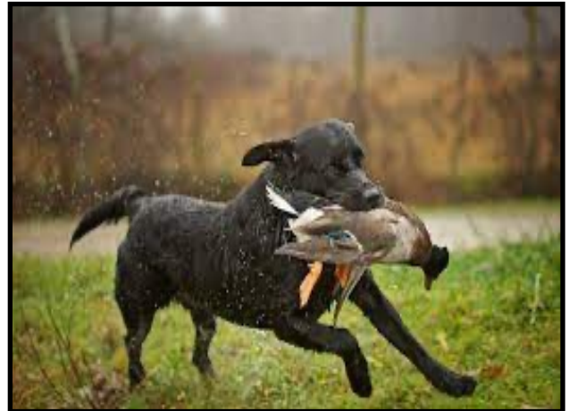
Minty’s DNA turns on when she sees a squirrel or smells some woodland animal that we’ll never see.